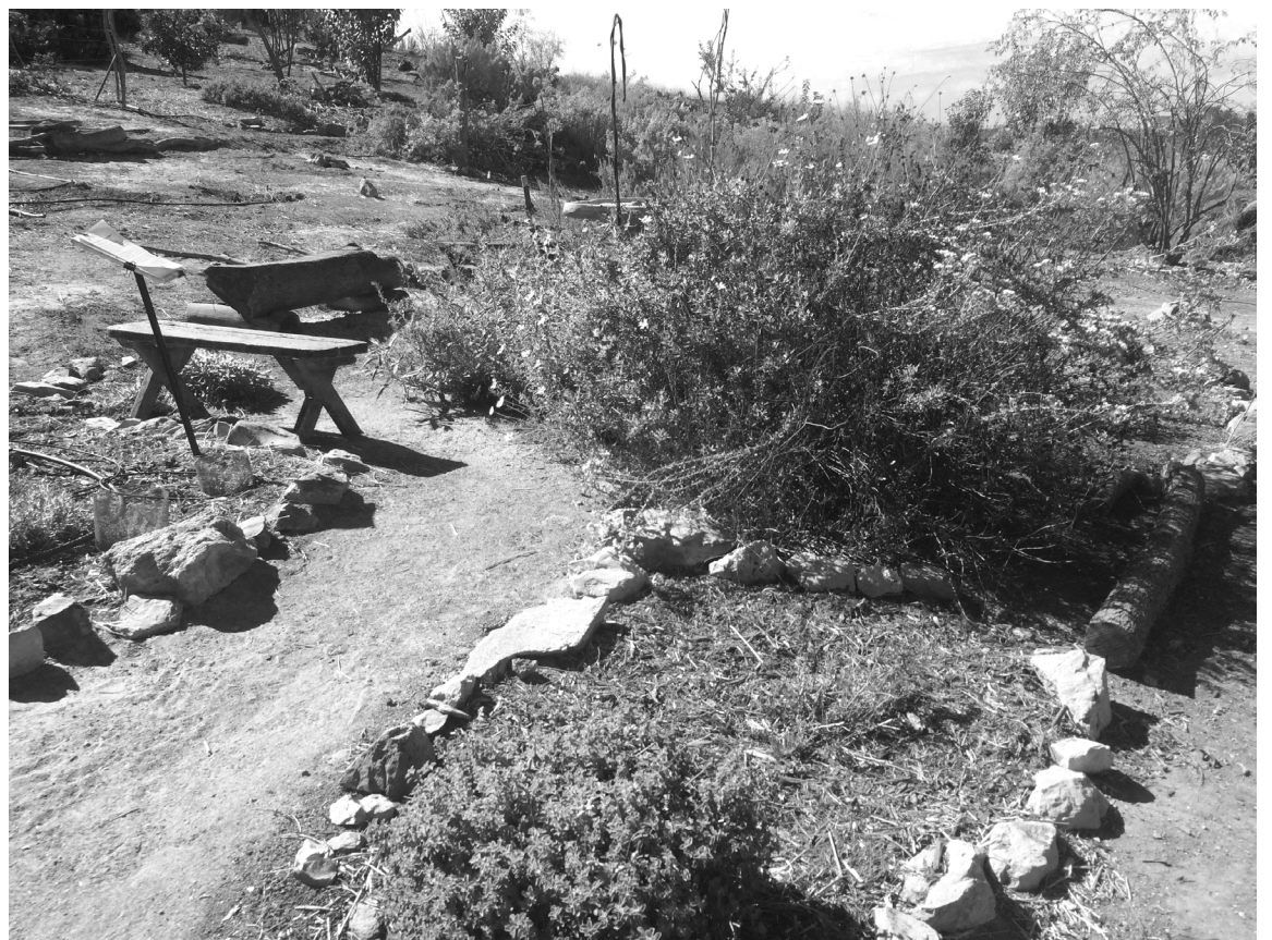
Heritage Garden

Students are invited to bring their own food waste to the garden. Kimmy Olivar, a student who is also involved with the garden, says she brings coffee grounds, banana peels, apples and