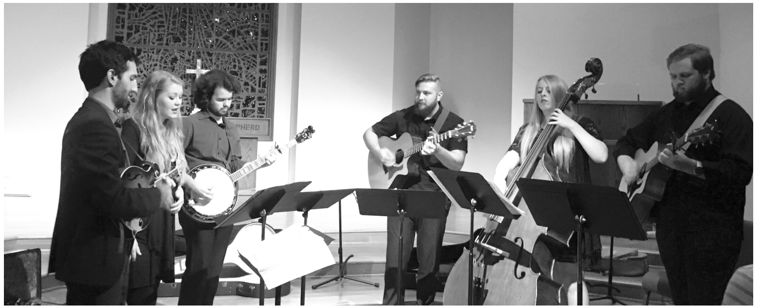
Americana Ensemble