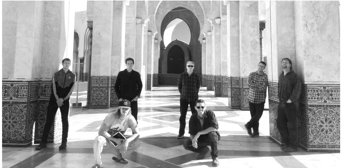
Mysterious Men of Morocco. Cool Cats of Casablanca.

fit those around them no matter how they feel. This selflessness has defined my stay in Morocco. Moving forward, I hope to some-