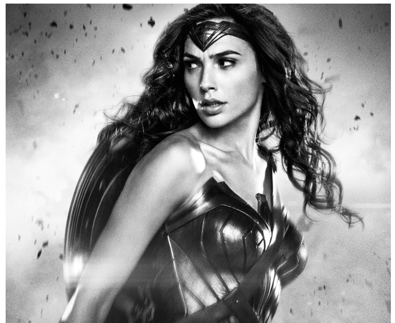
Gal Gadot as Wonder Woman

model for them. She fought against evil constantly and was pals with some of the most powerful people in the universe. It's not like she needed the fluffing to her already impressive resume,"