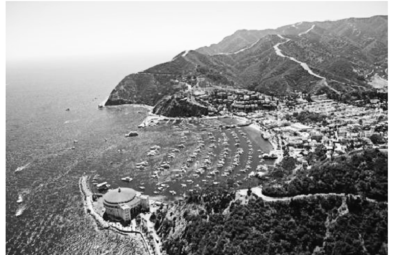
Catalina Island