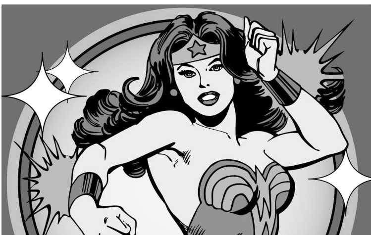
Wonder Woman, courtesy of people.com

The upcoming DC film isn't the only big news for comic hero and femme fatale, Wonder Woman. On Fri., Oct. 21, Wonder Woman was appointed the United Nations Honorary Ambassador for the Empowerment of Women and Girls. Her appointment aims to help the UN reach their goals of achieving gender equality and empowerment for all women. However, this move