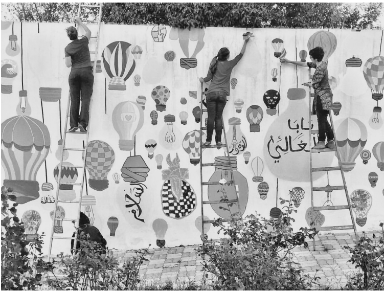
ATW 108: Meanwhile, at the wall...

day replicate this same presence of hospitality I have seen people move throughout their days while here in Morocco.