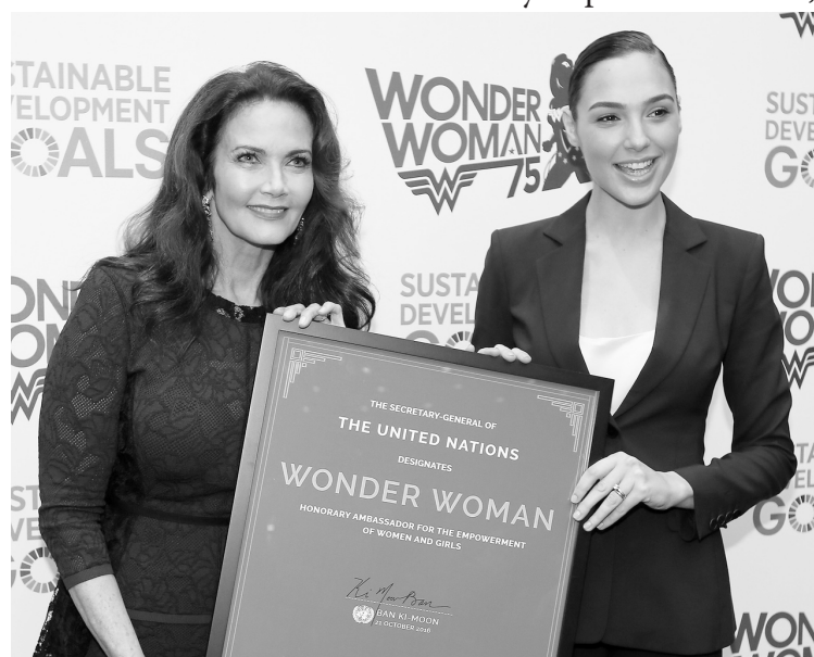
Lynda Carter and Gal Gadot receiving award