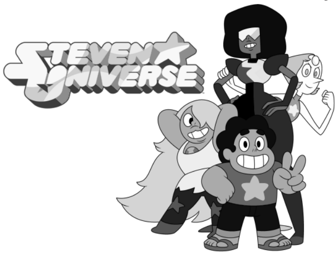
Steven Universe

alien rebels who have devoted their lives to protect Earth against the colonialism of their home planet. They are also Steven's guardians, and help him navigate his life. Oh, and the big twist, Steven himself is a Crystal Gem. Well, half Gem, half human, and the first of his kind. This coming-of-age show captivates adult-audiences because of its genuine