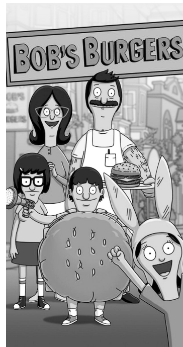
Bob's Burgers